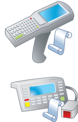
Voice Emulation Using client-side script